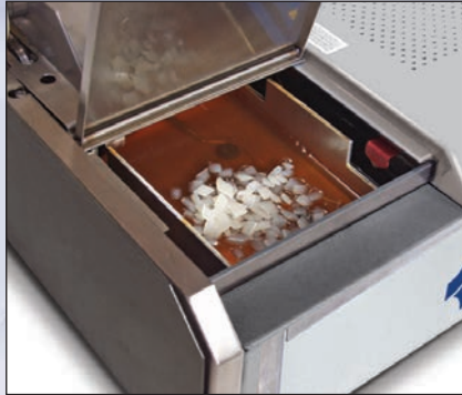
Open glue chamber