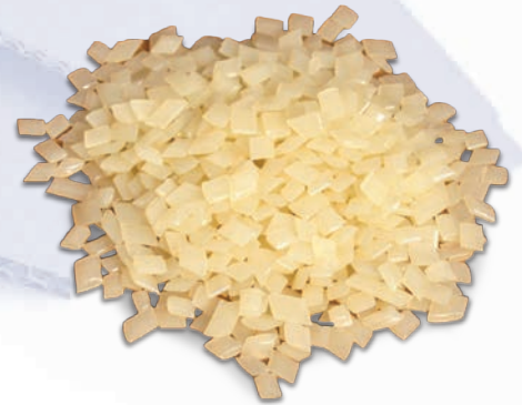
Hot melt granules in raw form